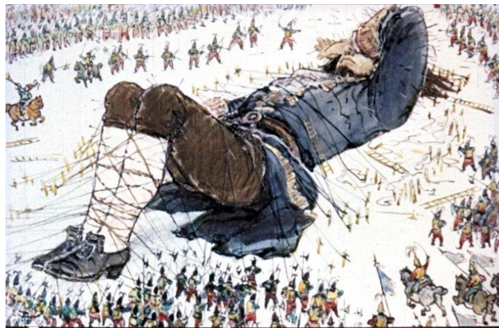
Figure 3 - Gulliver hold by the Lilliputian threads.

The first system law is the law of belonging. According to it our family system includes all those with whom we have had a sexual relationship, as well as all born and unborn children. Just note: any sexual relationship. Just imagine that in some countries like, so to speak “Sex and the City”, a man can visit hundreds of prostitutes and thus relate to a family system of each of them. A woman can have sex with a soccer team and thus relate to the family systems of all of them. But in all those Family System there are many internal Malicious programs that, like Lilliputian threads for Gulliver, wrap the child of such a parent. Up to the complete inability to act.