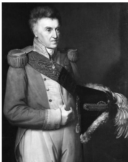
Fig. 2. Anthony, the King of Saxony (1755-1836)

So, one can note that in 1755, along with other outstanding men, a fate gifted Saxony with two persons, who became famous in the future: one of them was Samuel Hahnemann (the founder of homeopathy) and the second was Anthony the Kind (the King of Saxony).